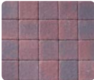
ROSE CREEK BLEND