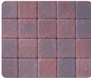
ROSE CREEK BLEND