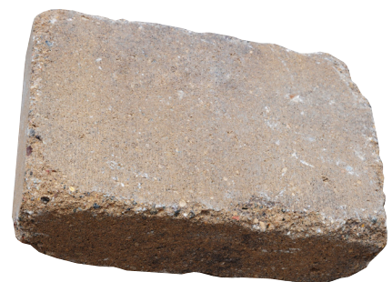
LEDGESTONE 4"x 8"x 12"

You can create a Ledgestone wall that has a random appearance by alternating placement of the three-unit panels (A, B, C, D) shown above.