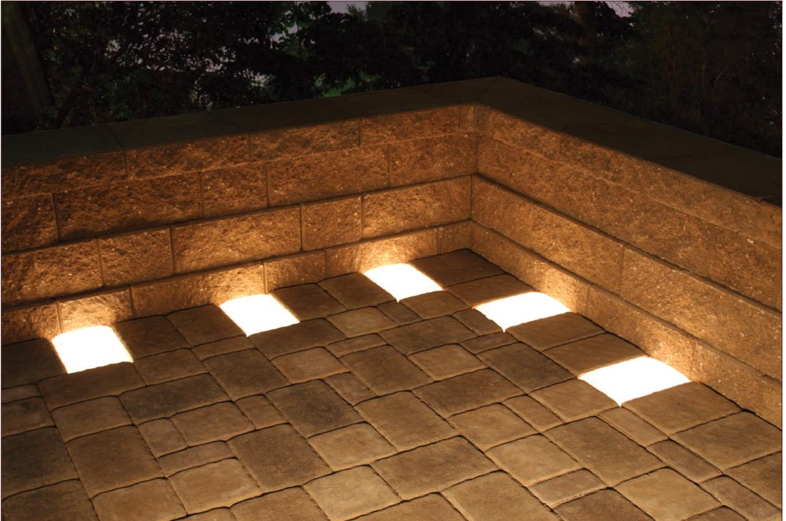
6" x 9" Cobblestone paver lights

Accent your paver patio, driveway, walkways and retaining walls with built-in lights by Kerr Lighting. Equipped with bulbs that operate on a low-voltage outdoor electrical system, these durable lights will bring a warm glow to your outdoor spaces and provide a measure of safety as well.