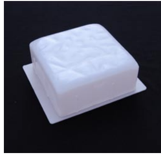
6" x 6" COBBLESTONE