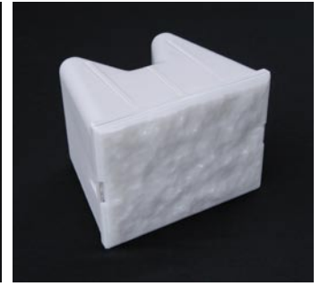
6" x 8" WALL LIGHT