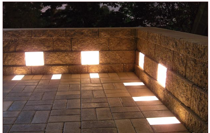
Brickstone paver and 6" x 8" wall lights

Kerr paver lights fit into the spaces of 6" x 6" and 6" x 9" Willow Creek Cobblestone pavers or a 4" x 8" Willow Creek Brickstone paver and will withstand foot and vehicle traffic. Kerr wall lights fit into the space of a 6" x 8" VERSA-LOK Cobble unit. All lights are made of high-impact plastic and are resistant to the elements.