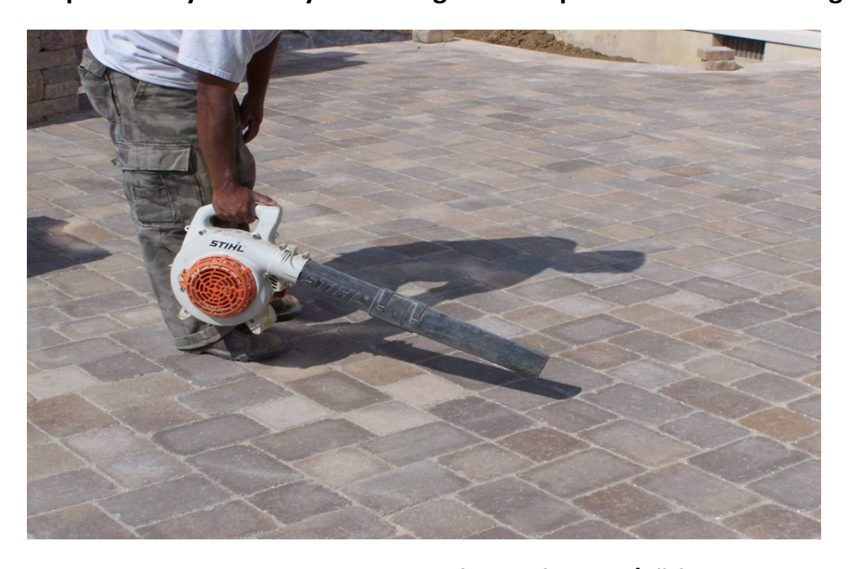
Step 8: Sand should be at bottom of chamfer or 1/8" from top