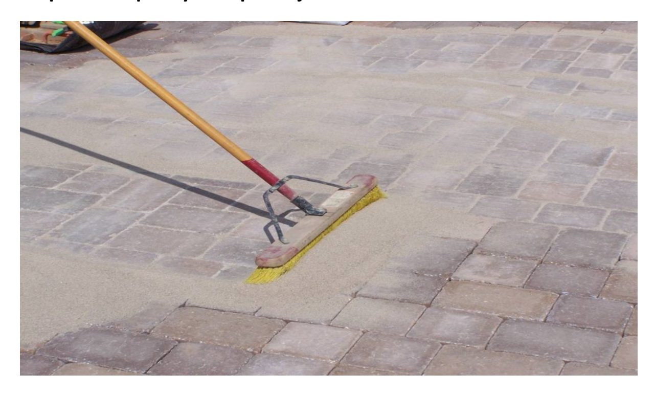
Step 2: Compact pavers