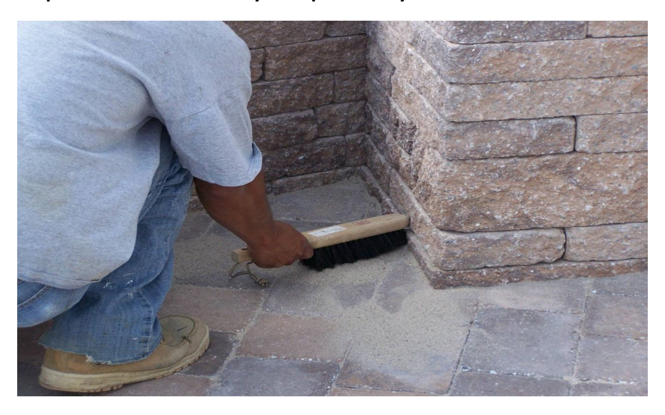
Step 6: Final sweep