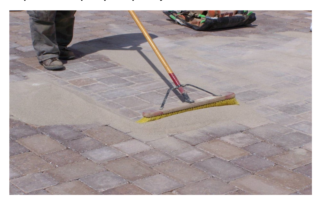
Step 4: Re-compact pavers