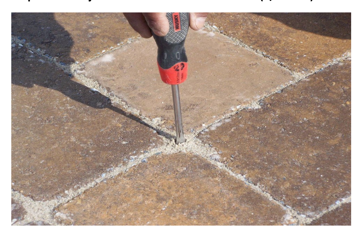
Step 12: Completed Project!