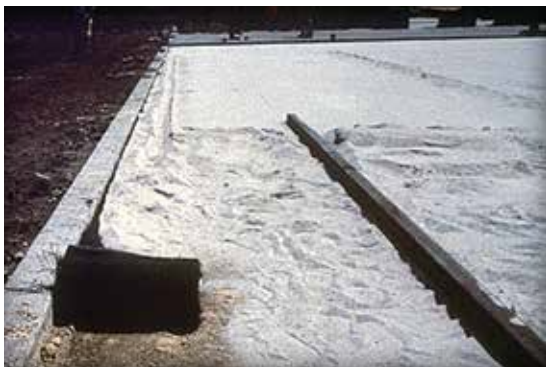
Figure 7. Woven geotextile used to contain bedding sand from migrating laterally. Visit www.icpi.org for detail drawings.

Interlocking concrete pavements should also be designed and constructed such that the bedding sand should not be able to migrate into the base, or laterally through the edge restraints. Dense-graded base aggregates with 5% to 12% fines (the amount passing the No. 200 or 0.075 mm sieve), will ensure that the bedding sand does not migrate down into the base surface. For pavements built over asphalt or con-