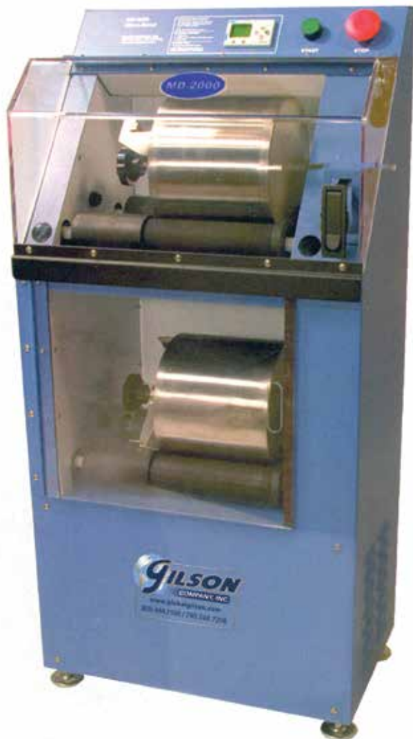
Figure 1. The Micro-Deval test apparatus.

The Micro-Deval test is evolving as the test method of choice for evaluating durability of aggregates in North America. Defined by CSA A23.2-23A, The Resistance of Fine Aggregate to Degradation by Abrasion in the Micro-Deval Apparatus (CSA 2004) and ASTM D 7428-08 Standard Test Method for Resistance of Fine Aggregate to Degradation by Abrasion in the Micro-Deval Apparatus , the test method involves subjecting aggregates to abrasive action from steel balls in a laboratory rolling jar mill. In the CSA test method a 1.1 lb (500 g) representative sample is obtained after washing to remove the No. 200 (0.080 mm) material. The sample is saturated for 24 hours and placed in the Micro-Deval stainless steel jar with 2.75 lb (1250 g) of steel balls and 750 mL of tap water (See Figure 1). The jar is rotated at 100 rotations per minute for 15 minutes. The sand is separated from the steel balls over a sieve and the sample of sand is then washed over an 80 micron (No. 200) sieve. The material retained on the 80 micron