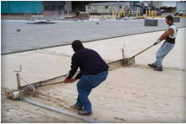
Figure 4. A two-man hand pulled screed