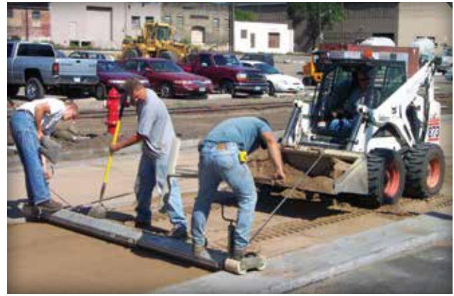
Figure 5. Mechanical screeding is the most efficient method of bedding sand installation

Role of Bedding Sand in Construction —Provided that the base was installed according to recommended construction practices and tolerances (See ICPI Tech Spec 2—Construction of Interlocking Concrete Pavements ), the bedding sand ensures that the pavers have a uniform slope and meet surface tolerances without surface undulations or “waviness.” Sand should be loosely screeded to a uniform thickness of 1 in. (25 mm) to 1½ in. (38 mm), which will compact to a thickness of ¾ in (19 mm) to 1¼ in (31 mm). for vehicular applications. Screeds can either be pulled by hand or by machine (mechanical screed) as shown in Figures 4 and 5. Mechanical screeding provides the most efficient method. Pavers are placed on the loose uncompacted sand. Contractors should select sand that allows the pavers to be uniformly seated during their initial compaction with a minimum 5000 lb (22kN) force plate compactor.