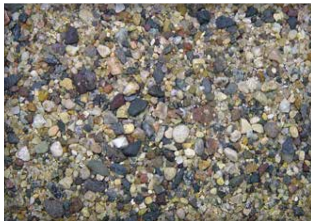
Figure 3. Example of sand from the ICPI bedding sand test program with a total combined percentage of sub-angular and sub-rounded particles equal to 65% according to ASTM D2488

Recommended Material Properties —Table 3 lists the primary and secondary material properties that should be considered when selecting bedding sands for vehicular applications. Bedding sands may exceed the gradation requirement for the maximum amount passing the No. 200 (0.075 mm) sieve as long as the sand meets degradation and permeability recommendations in Table 3. Micro-Deval degradation testing can be replaced with sodium sulfate or magnesium soundness testing as long as this test is accompanied by the other primary material property tests listed in Table 3. Other material properties listed, such as petrography and angularity testing are at the discretion of the specifier and may offer additional insight into bedding sand performance.